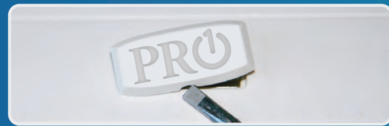
Removable Badge System

Heavy duty products for HVAC Professionals